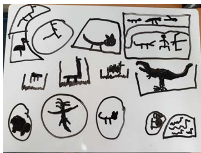
'At the Zoo' - by Wyatt

In Maths we love to get our work done and have a class game of 'Go Fish' or 'UNO'. While these are all fun, what we have enjoyed most is building our social and communication skills through guided play – especially with construction activities!